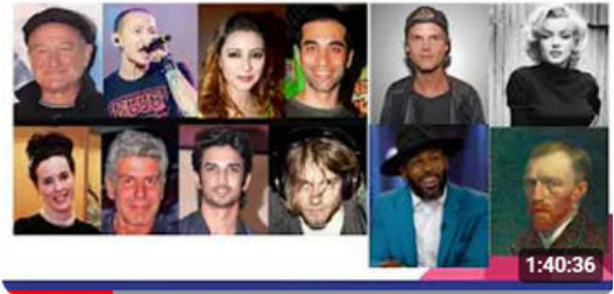
Anxiety, Depression and Suicide through the Lens of Autism (Suicide)

This valuable resource is available along with others via our YouTube Channel.